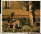
First Freedom is performed daily in the Outdoor Theatre

Step back in time and celebrate the Fourth of July with the Founding Fathers (and Mothers) in downtown Provo at the Crandall Historical Printing Museum.